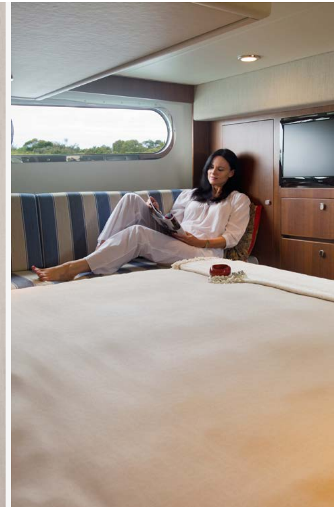
ABOVE - Shown in Satin Teak timber finish. RIGHT - Shown in Satin Walnut timber finish