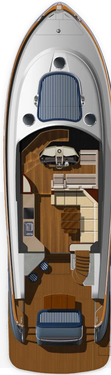
DAYBRIDGE SALOON DECK