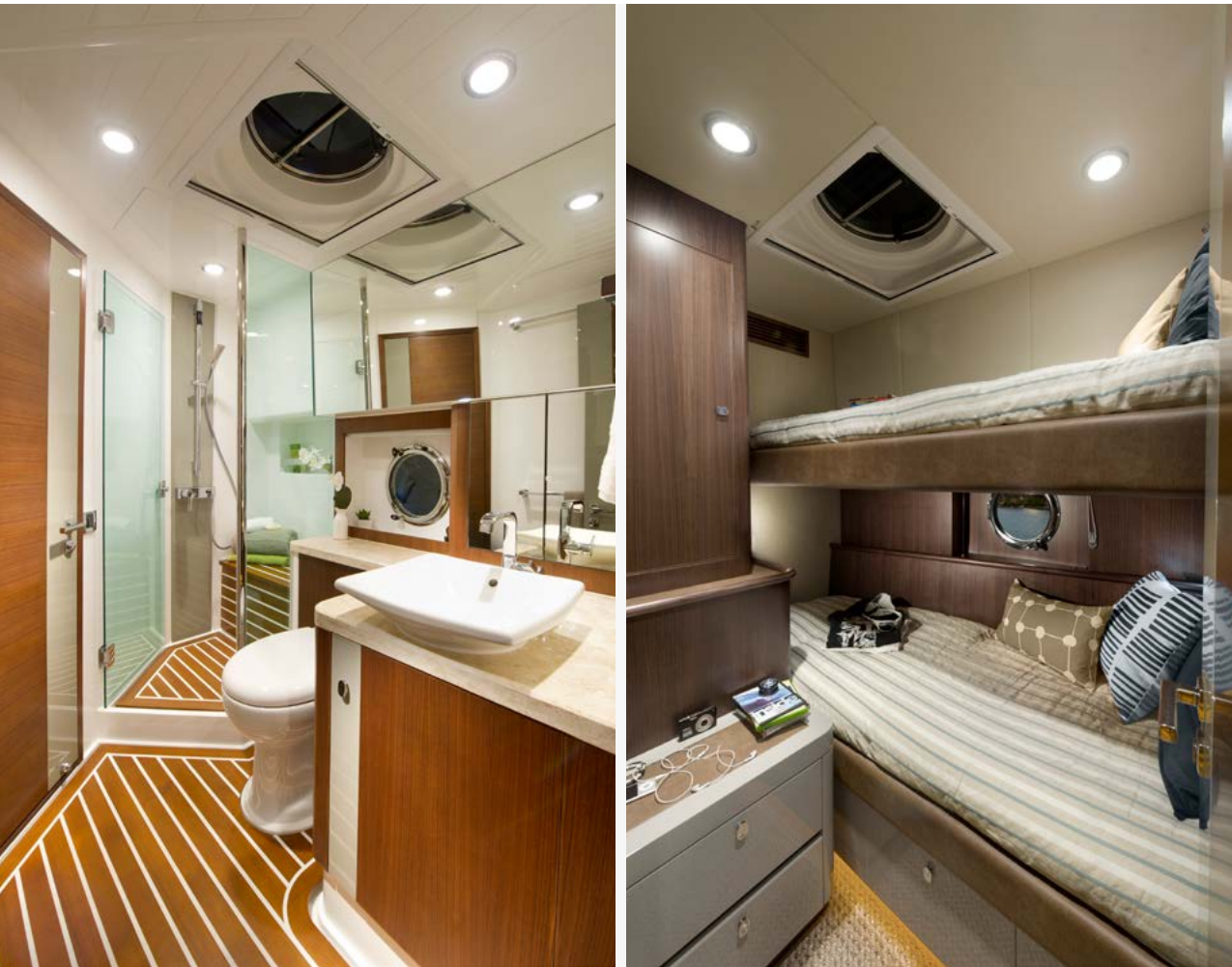
ABOVE - Ensuite shown in Satin Teak timber finish. Starboard stateroom shown in Satin Walnut timber.

The third guest suite is no less highly specified. Here there are twin, two-metre-long upper and lower berths, hanging locker, bedside table and drawers and the benefit of an opening portlight, circular deck hatch above and plush carpeting fleecy between your toes.