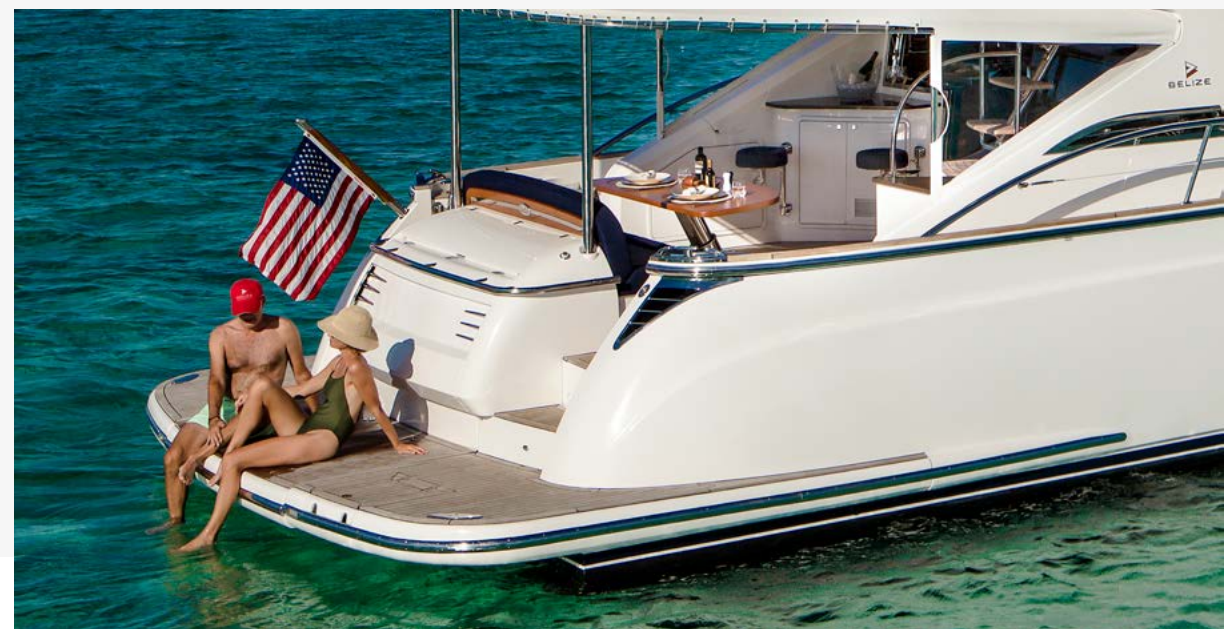
Right - Daybridge bimini top shown