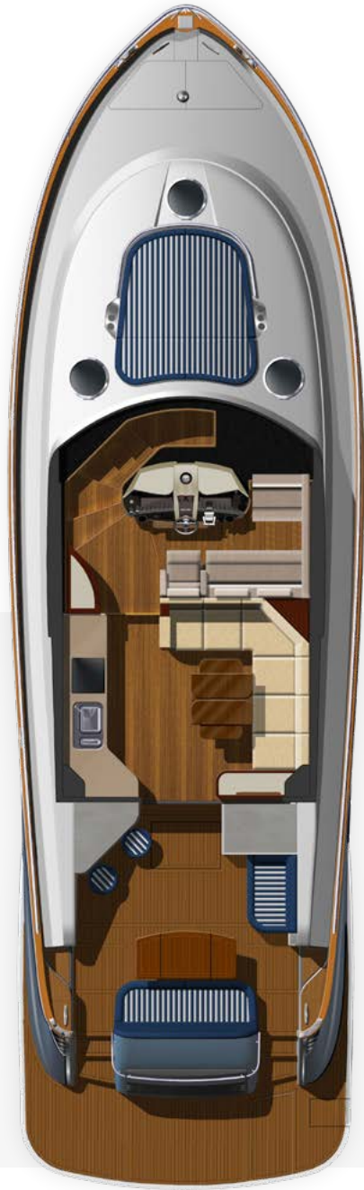
SEDAN SALOON DECK