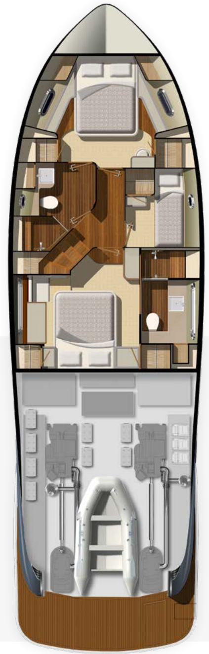
ACCOMMODATION DECK Grand Presidential 3 stateroom